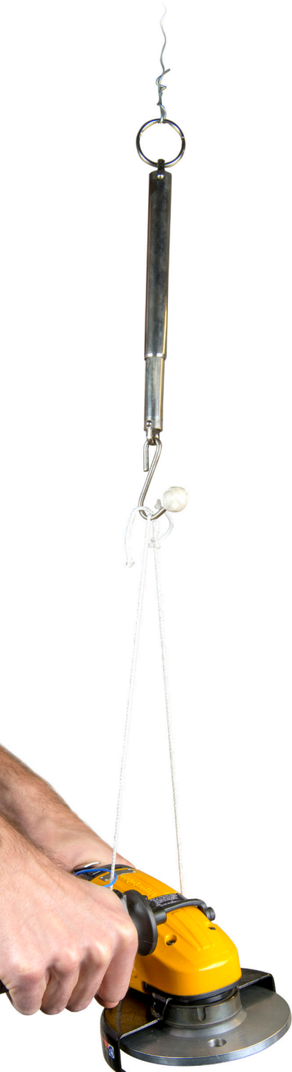
The feed force is measured by suspending the grinder in a scale.

Grinders are run under no-load conditions, equipped with an aluminum test wheel of the same size as the grinder is designed for. The test wheels have a pre-defined unbalance given in the standard. The size of the test wheel in this particular case is \varnothing 125 mm (5").