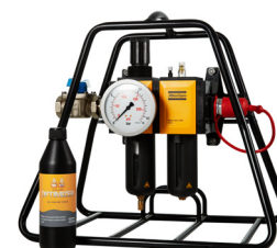
Productivity kit FRL