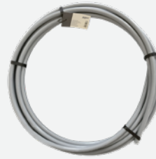
PA rolled pipe