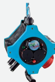
Power and air supply unit